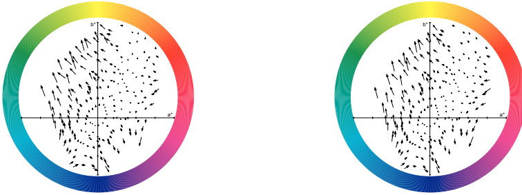
LDCR_CDMTC-E_0002-Colour rendering diagram