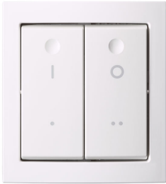
UID8460 Front image