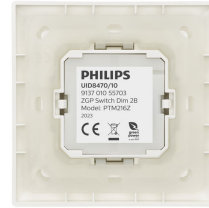
UID8470 Switch Detail Photo Back