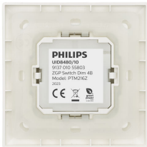
UID8480 Switch Detail Photo Back